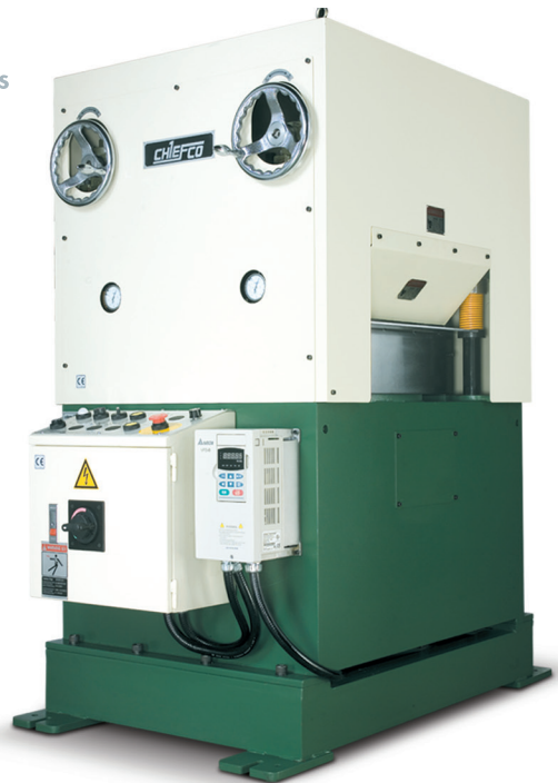
主要規格表 Straightener Main Specifications